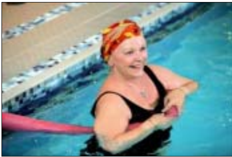
From the YWCA Encore website

Encore is an eight-week program of two-hour sessions specially designed for women who have had breast cancer. It helps restore mobility, flexibility and confidence through gentle exercise. This national program is funded by Avon, and auspiced in Tasmania by the Hobart Women's Health Centre. Programs are available in both Hobart and Launceston. Trained facilitators guide women through specially designed ground and warm water exercises, and provide the opportunity for women to support one another in a safe sharing environment.