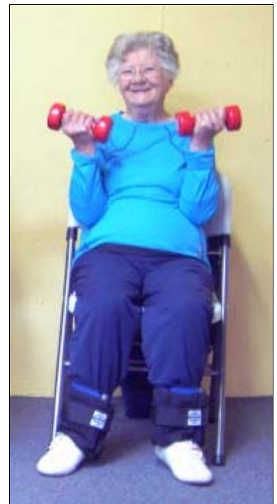
Ageing Well with Weights participant

Please phone reception on 6231 3212 to receive your enrolment forms or collect them from the Centre during opening hours. Please note you may require your doctor's approval to participate (see enrolment form for details).