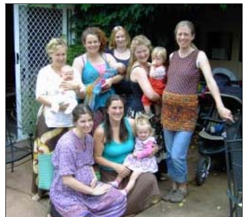
Mums and Bubs at Birth and Beyond

Phone the Centre on 6231 3212 for more information about topics and presenters.