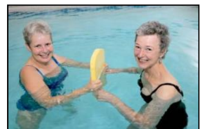
YWCA Encore website