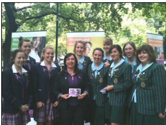
Health Minister Michelle O'Byrne and young women

A postcard campaign asking those questions was launched by the Minister for Health, Michelle O'Byrne, on the 8th March 2011, to mark the 100 th anniversary of International Women's Day. The lawns of Parliament House were alive with celebrations for the centenary of IWD and those attending the launch were entertained by performer, Kath Prescott, who gave a circus interpretation of how women manage to balance and juggle the daily issues of their lives.