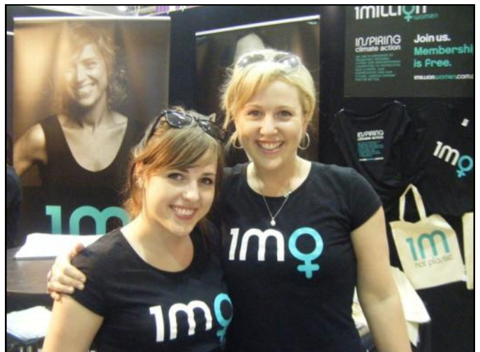
Two wonderful 1MW volunteers spreading the word at the Sydney Royal Easter Show, 2010

You can also 'Like' 1MW on Facebook at http://www.facebook.com/1MillionWomen and follow on Twitter @1millionwomen.